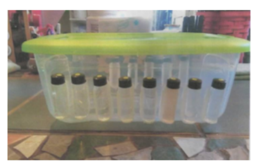
Plasma Energy Station with 14 Gans filled tubes

Paul and Lynn also discussed their plasma energy station that has 14 different liquid plasma combinations permanently attached to a tub that they filled with filtered water. They have consumed the charged water for one to two daily meal replacements of 20 cc's each of liquid plasma since June, 2016. One of the vials has the liquid